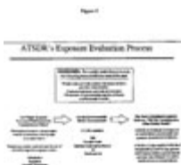
Figure 5. ATSDR's Exposure Evaluation Process