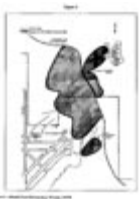
Figure 8. Operable Unit 1 TCE Plume, October 1996