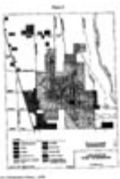
Figure 3. Land Use in the Vicinity of George Air Force Base