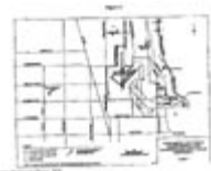
Figure 4. Approximate Locations of Known Municipal and Domestic Water Supply Wells in the Vicinity of George Air Force Base