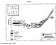
Figure 7. Simplified Conceptual Hydrogeologic Cross Section