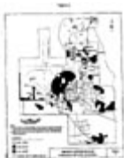
Figure 2. Operable Unit (OU) Site Locations