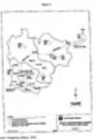
Figure 6. Major Hydrogeologic Features in the Mojave River Basin