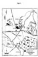
Figure 1. Vicinity Map