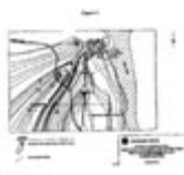
Figure 9. Simulated Flowlines and Extraction Well Capture Zones at OU 1 Lower Aquifer