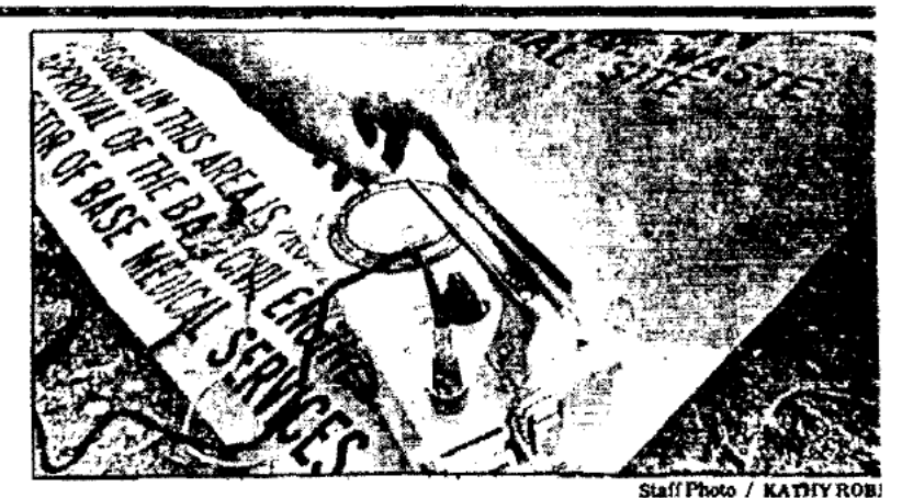
Dally Press staffers got no reading using a Geiger counter at si

Oson said the area is scheduled to be fenced next year.